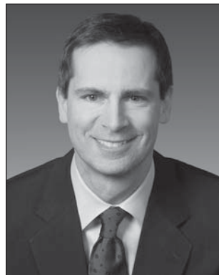
Dalton McGuinty Premier

A handwritten signature in black ink that reads "Dalton McGuinty".