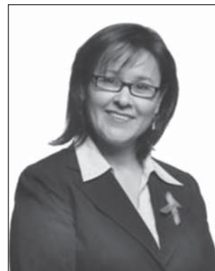
Leona Aglukkaq Minister of Health / Ministre de la Santé Government of Canada / Gouvernement du Canada

A handwritten signature in black ink, appearing to read 'Leona Aglukkaq'.