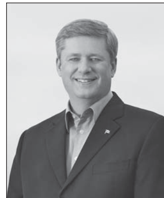
The Rt. Hon. Stephen Harper, P.C., M.P.

On behalf of the Government of Canada, I wish everyone a most productive session of deliberations.